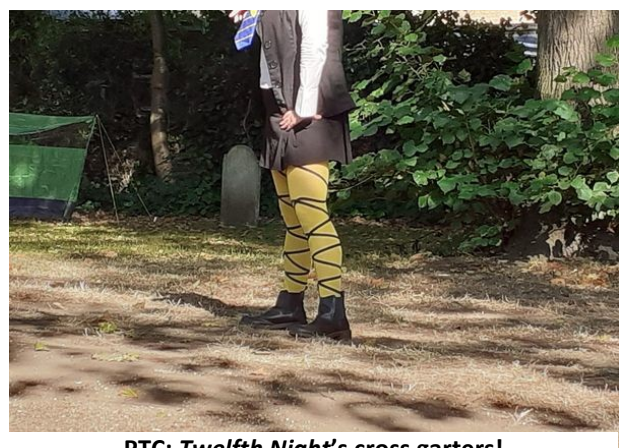
PTC: Twelfth Night's cross garters!