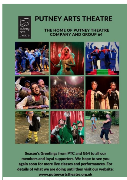
PAT: Christmas poster