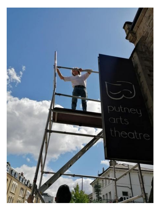
Fixing the Putney Arts Theatre sign

Members of PTC and PAT, Group 64 parents, and many individuals from the Putney Community