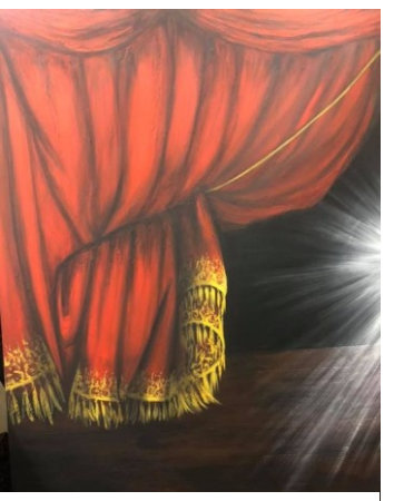
Ghost Light by Roberta Volpe

enabling participants to feed back, discuss and share, with break-out rooms so that a few students could develop ideas before returning to the main group. The possibilities of teaching and communicating in this way were stretched to the limit, so thanks and admiration are due to all the Group 64 team. There were also two Group 64 productions: the Shine-On Festival in December comprised a number of plays performed by different age groups, and also some workshops, on lighting, directing and other topics; then Find A Partner in March was presented online by the older teenagers, exploring the anxieties, pressures and occasional comedy of searching for the right person.