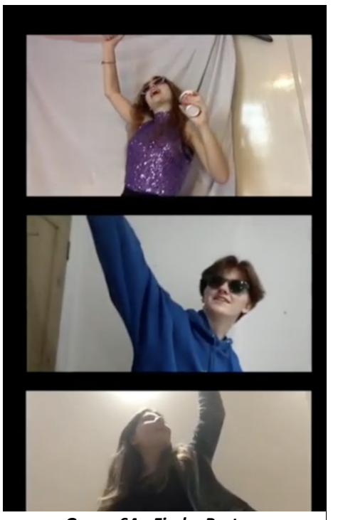
Group 64: Find a Partner

Putney Theatre Company also mounted a bravura response to the challenge. The list of cancelled shows might have suggested a thespian disaster zone: The Hollow, Cyrano de Bergerac (cancelled twice, summer 2020 and 2021), Alice in Wonderland, Di & Viv & Rose, and The Hound of the Baskervilles. But PTC triumphed in adversity. The new writing production Truth or Dare went online short plays exploring the mostly comic and occasionally worrying possibilities suggested by the title. Technical improvements now enabled online sale of modestly priced tickets for this and subsequent online productions. Then began a series of online monologues, a simply astonishing 52 brief extracts from plays, ranging wide in place, period and genre. These are listed, with the actors and directors, later in this report.