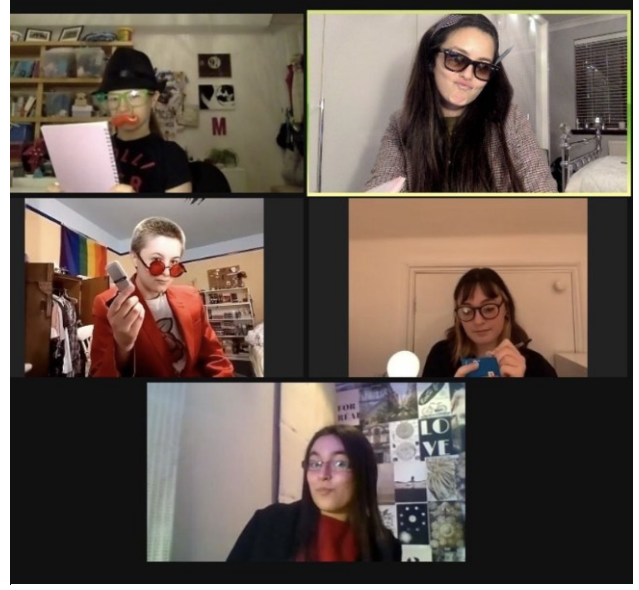
Online Zoom class (14-17)