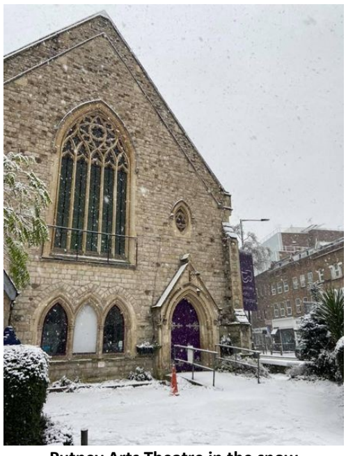
Putney Arts Theatre in the snow