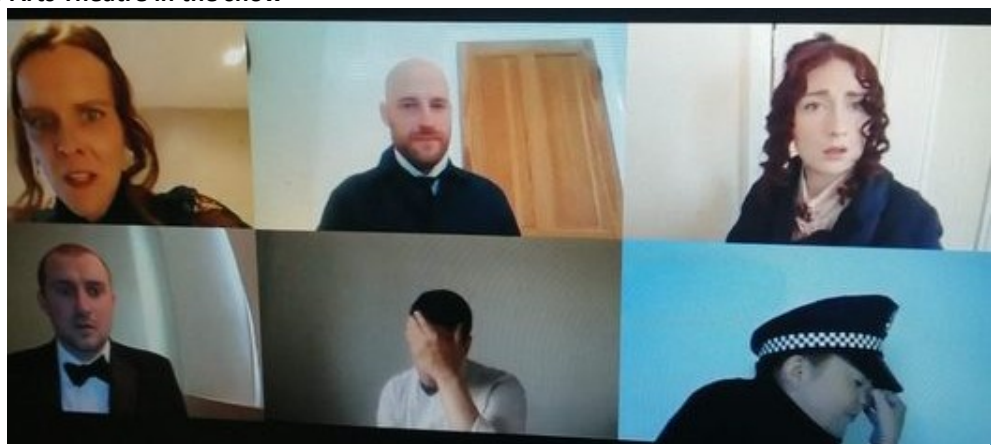
PTC: The Magistrate